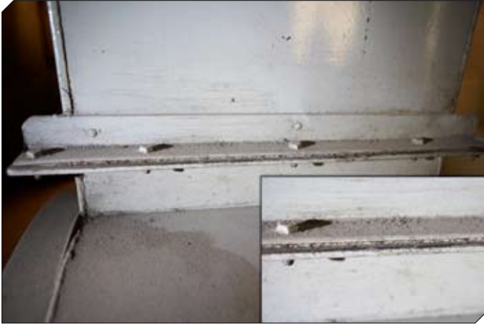
Figure 14: Asbestos rope seal in duct joint with close-up inset.