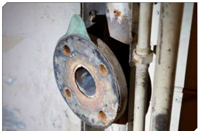
Figure 7: Asbestos-containing gasket.