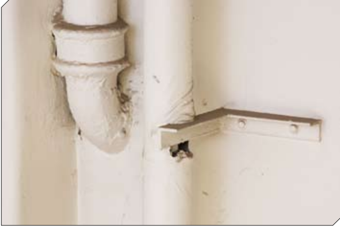
Figure 8: Damaged and exposed pipe wrapped with asbestos lagging.