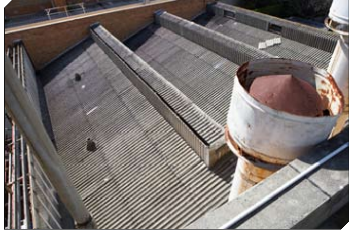
Figure 3: Corrugated asbestos cement roof sheets.