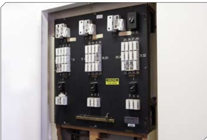
Figure 16: Asbestos-containing zelemite electrical switchboard panel.