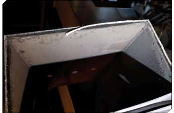
Figure 15: Detached asbestos rope seal and remnant debris on duct.