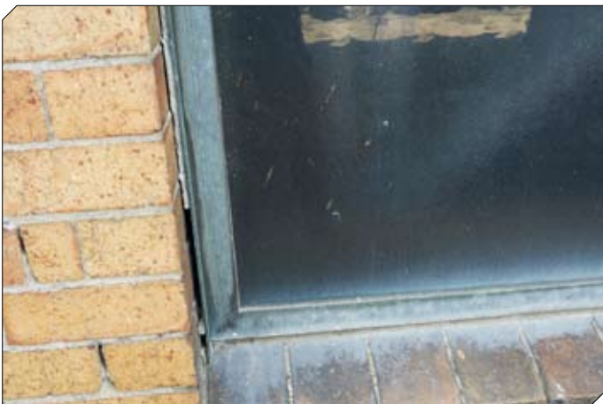
Figure 12: Deteriorated asbestos-containing mastic between window frame and bricks.