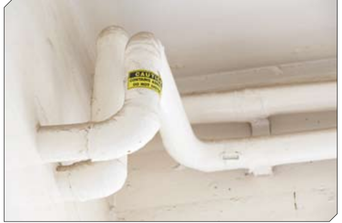
Figure 9: Labelled pipe wrapped in asbestos lagging.