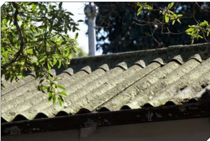
Figure 4: Corrugated asbestos cement roof sheets.