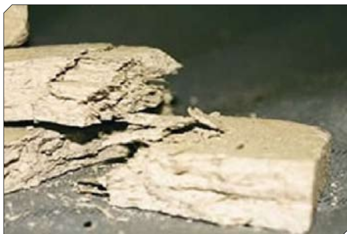
Figure 19: These pieces of broken asbestos cement sheet are not fixed or installed.