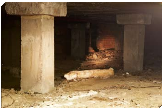
Figure 18: Unfixed asbestos lagging from a pipe.