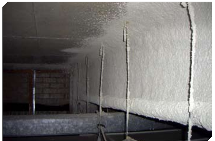
Figure 11: Sprayed asbestos.