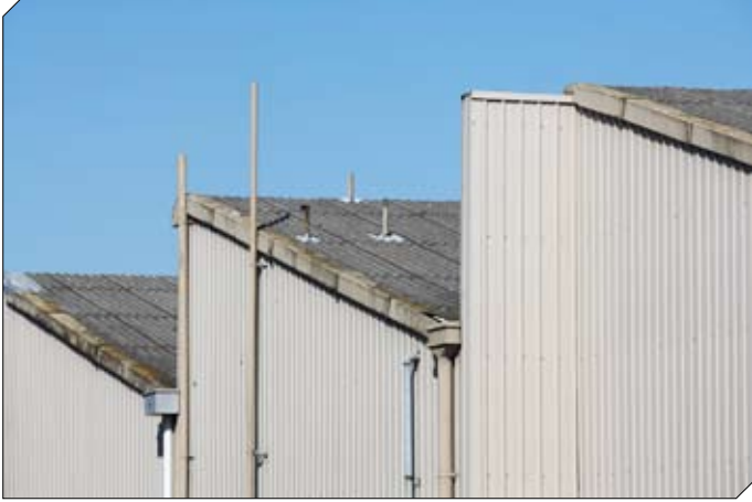
Figure 2: Saw-tooth design roof with corrugated asbestos cement roof sheets.