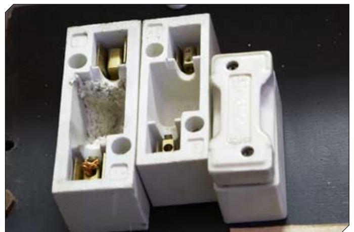
Figure 17: Friable asbestos insulation in an electrical fuse housing.