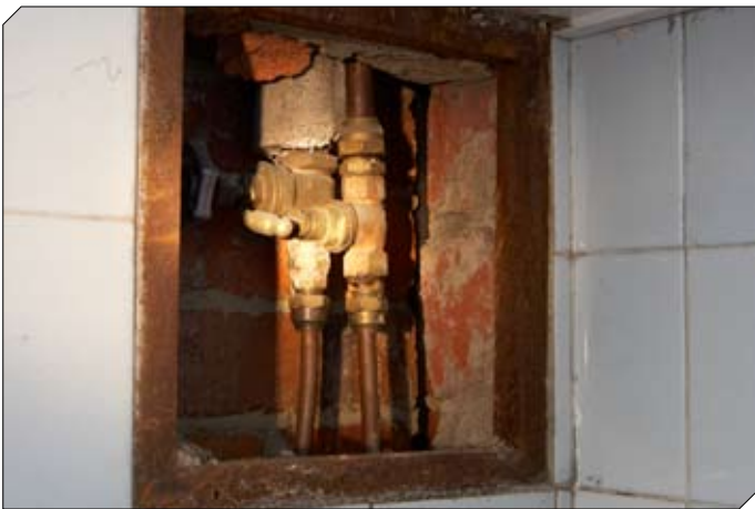
Figure 10: Exposed asbestos lagging on pipe.