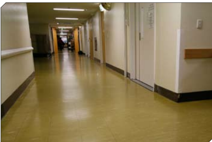
Figure 6: Vinyl tiles containing asbestos.